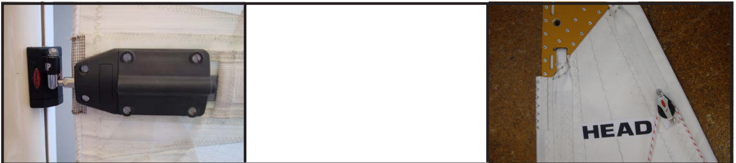
Sailman adjustable 'batten tensioning' luff receptacle to suit pressure absorbing slide of your choice.