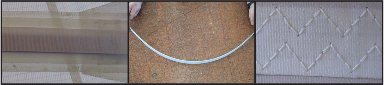
Anti-chafe webbing along BOTH sides of batten pockets.