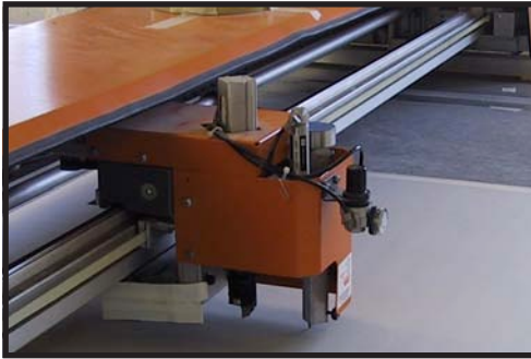
Panels in-house computer designed and cut.