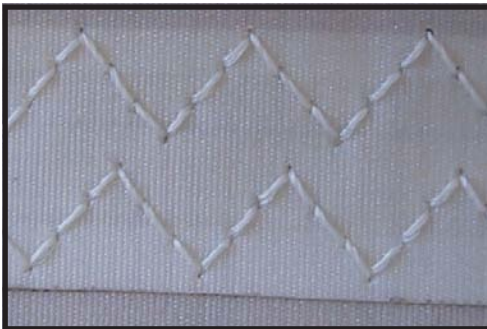
Anti-chafe 3-step stitched seams.