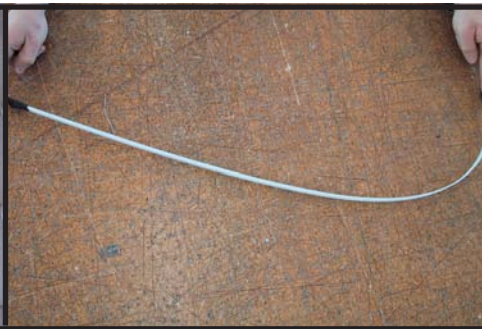
Tapered non-shattering & anti-twist Epoxy or Fibreglass battens.