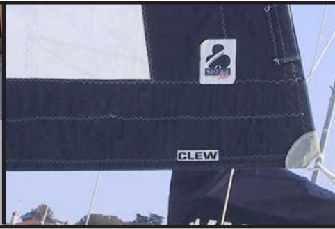
Option of lightweight UV protective strips on leech & foot.