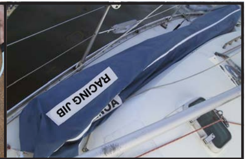
Full length zipped bags.