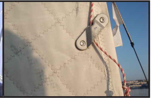
Spectra leech line with alloy cleat.